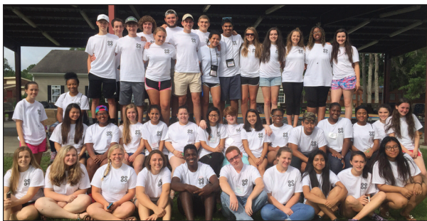
2017 Co-op Camp Participants