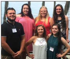
2017 SkyLine Delegation to Co-op Camp

The Cooperative Council of North Carolina held its annual Cooperative Youth Leadership Conference in June for high school students at the NC FFA Center at White Lake, NC. Sponsored by cooperatives and agricultural organizations, around 50 students from across North Carolina attended the camp, enjoying a week by the lake.