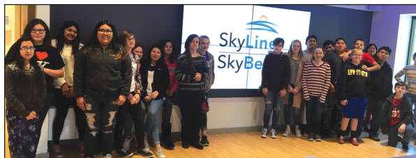
This was the second group of Avery County Middle School students who visited SkyLine's Boone Customer Center on March 24 as part of an Extreme STEM tour of area businesses.

*Some restrictions apply. Residential only. One month minimum required. Modem leases, if needed, are not included.