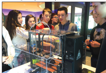
Students got a close-up view of SkyLine's 3-D printer, which is on display in the Boone Customer Center lobby.