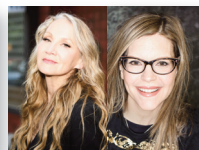
Joan Osborne & Lisa Loeb July 11 | 7:30 pm