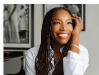
Heather Headley with Western Piedmont Symphony July 13 | 7:30 pm