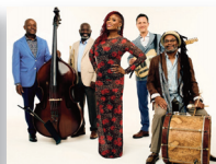
Ranky Tanky with Ms. Lisa Fischer July 6 | 7:30 pm