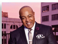
Peabo Bryson July 16 | 7:30 pm