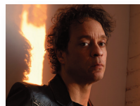
Amos Lee June 28 | 7:30 pm

For more information, visit www.appsummer.org .