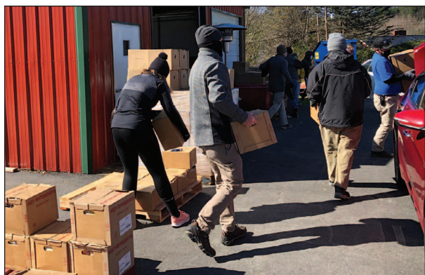
After delivering food items to the Ashe County Sharing Center, seven SkyLine employees joined other local volunteers in helping with the non-profit's November 2 drive-through food distribution to 284 families.