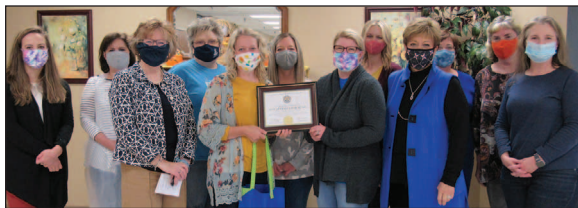
2020 Chamber Awards – Ashe Services for the Aging