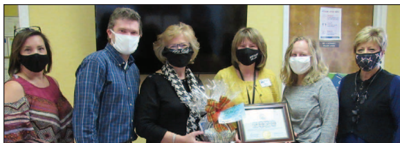
2020 Chamber Awards – Ashe Early College