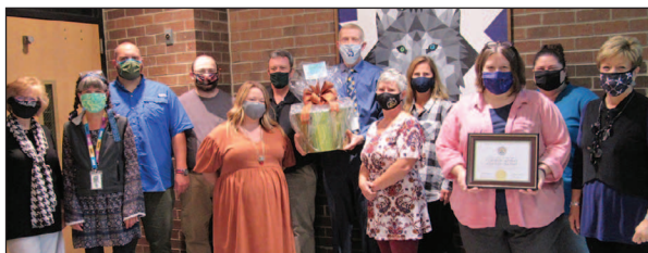
2020 Chamber Awards – Ashe County High School

Nominations for "Outrageously Good" Customer Service awards may now be submitted year-round, so when you experience stellar customer service, take time to contact the Ashe Chamber to make your individual or business nomination. Send those to: ashechamber@skybest.com .