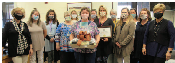
2020 Chamber Awards – Westwood Elementary