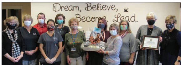
2020 Chamber Awards – Blue Ridge Elementry