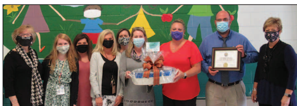
2020 Chamber Awards – Mountain View Elementary