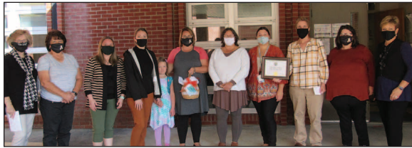
2020 Chamber Awards – Ashe Early Learning Center