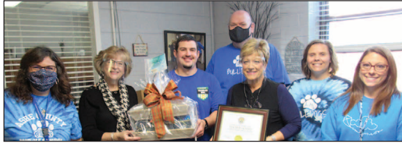
2020 Chamber Awards – Ashe County Middle School

Please remember to support this and other area food drive initiatives throughout the calendar year. Your support makes all the difference to those facing hunger. Note: Photo highlights of additional food deliveries will be included in next month's newsletter.