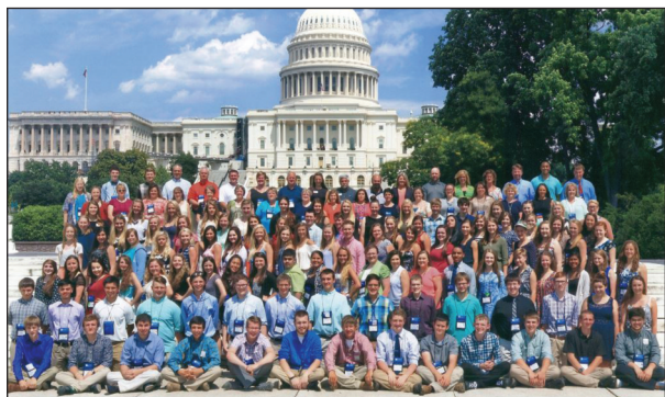
2016 FRS Youth Tour – Washington, D.C. – June 2016