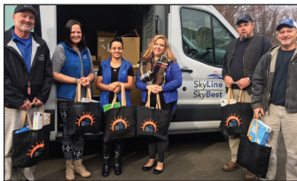
SkyLine staff are shown with breakfast items earmarked for the Solid Rock Food Closet in Sparta.

Thanks to our members/customers, directors and employees, our fourth annual "Rise and Shine" Breakfast Drive, held in September and October, collected more than 1,800 donated food items to share with area food