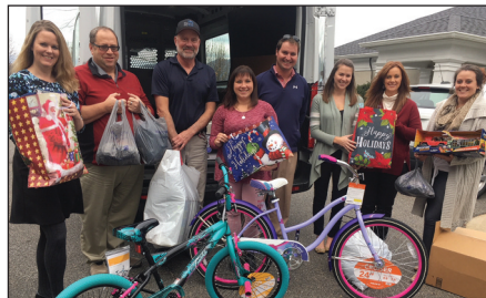
Our employees continue to support local Christmas charities that reach out to children and seniors in need, including the Ashe County Interagency Children's Christmas Project and Appalachian Senior Program's Project Star.

SkyLine Telephone Membership Corporation is the recipient of Federal financial assistance from the U. S. Department of Agriculture (USDA). The USDA prohibits discrimination in all its programs and activities on the basis of race, color, national origin, age, disability, and where applicable, sex, marital status, familial status, parental status, religion, sexual orientation, genetic information, political beliefs, reprisal, or because all or a part of an individual's income is derived from any public assistance program. (Not all prohibited bases apply to all programs.) Persons with disabilities who require alternative means for communication of program information (Braille, large print, audiotope, etc.) should contact USDA's TARGET Center at (202) 720-2600 (voice and TDD). To file a complaint of discrimination, write to USDA, Director, Office of Civil Rights, 1400 Independence Avenue, S.W., Washington, D.C. 20250-9410, or call 1-800-795-3272 (voice), or (202) 720-6382 (TDD). "USDA is an equal opportunity provider, employer and lender."